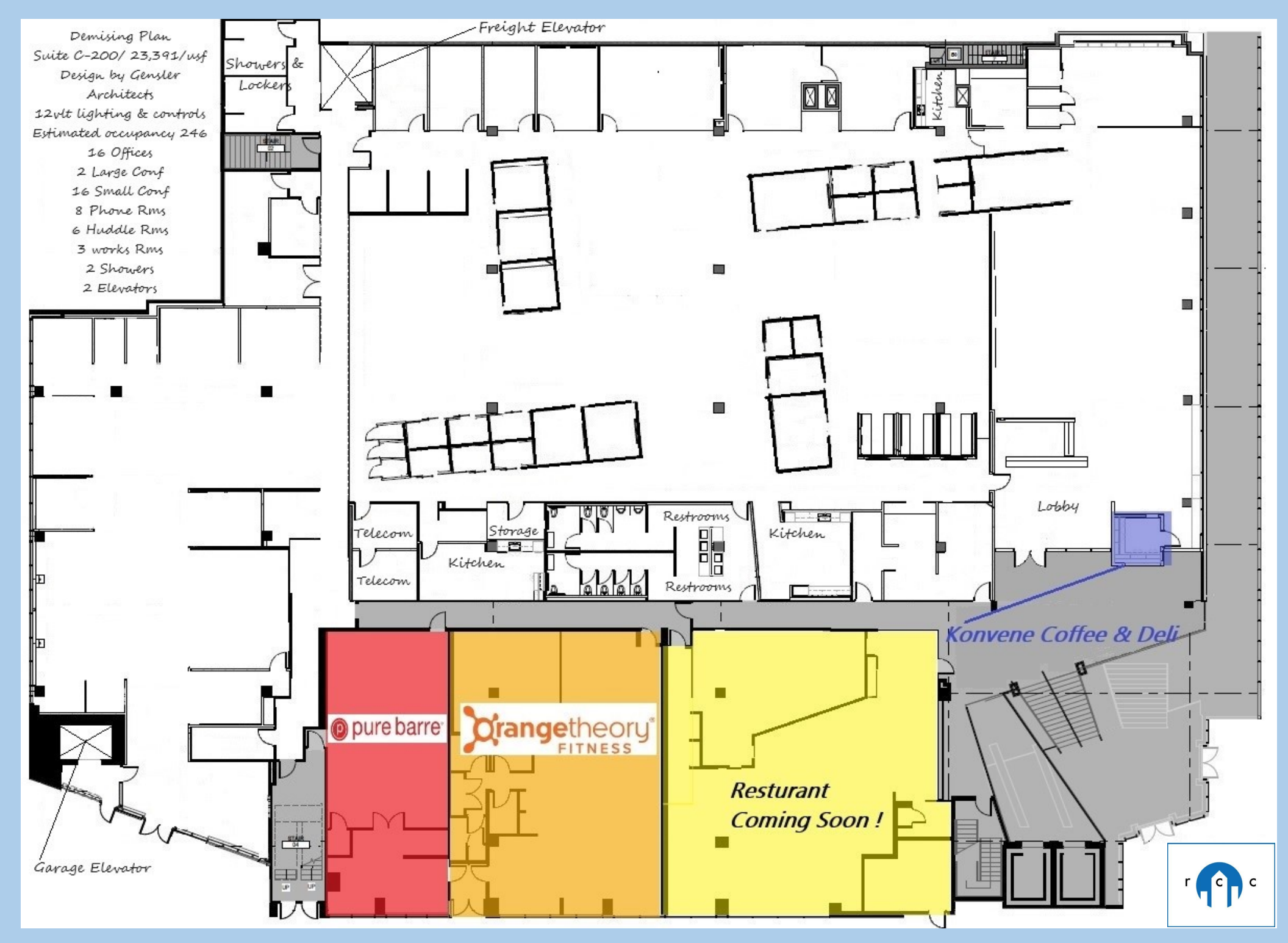
No warranty or representation, express or implied, is made as to the accuracy of the information contained herein, and same is submitted subject to errors omissions, change of price, rental or other conditions, withdrawal without notice, and to any specific listing conditions, imposed by our principals.